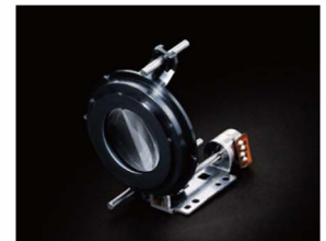
RXD stepping motor unit

The AF drive incorporates an RXD (Rapid eXtra-silent stepping Drive) stepping motor unit. RXD uses an actuator that is able to precisely control the rotational angle of the motor, allowing it to drive the focusing lens without passing through a reduction gear. The addition of a sensor that detects the position of the lens to a high degree of accuracy enables high-speed and precise AF, which allows you to maintain razor-sharp focus when shooting continually moving subjects or filming video. The lens is also remarkably quiet, eliminating concerns of drive sounds being picked up while shooting video.