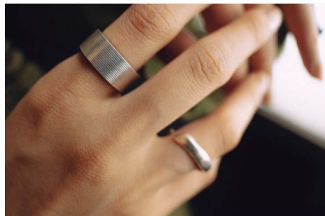
Focal Length: 17mm Exposure: F3.2 1/400sec ISO: 400

When shooting very close to the subject, the lens enables expressive imagery with highly blurred backgrounds, a feature unique to large aperture lenses. From portrait to landscape, and your everyday life, this lens captures all of the excitement and discoveries with the finest possible detail.