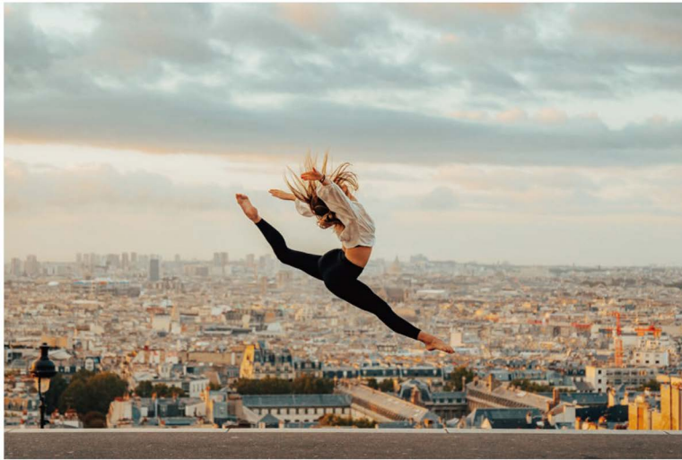
Focal Length: 48mm Exposure: F3.2 1/800sec ISO: 400

The world's first 1 17-70mm F2.8, large aperture standard zoom lens for APS-C mirrorless cameras