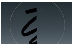
Left side: Without Fluorine Coating Right side: With Fluorine Coating

The front surface of the lens element is coated with a protective fluorine compound that is water- and oil-repellant. The lens surface is easier to wipe clean and is less vulnerable to the damaging effects of dirt, dust, moisture and fingerprints. Leak-proof seals throughout the lens barrel further protect your equipment, especially when shooting outdoors.