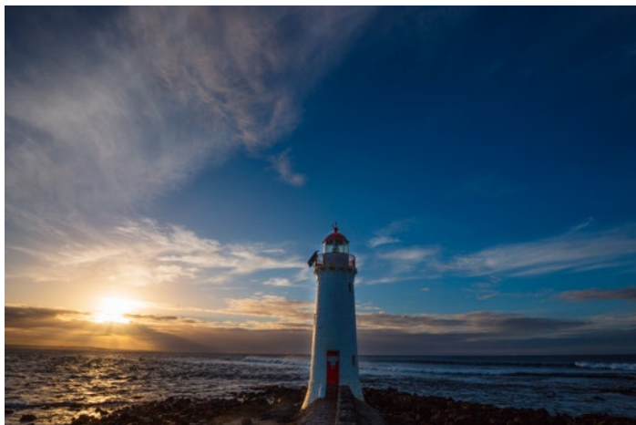
Focal Length: 17mm Exposure: F/16 1/125sec ISO: 100

Beautifully captures the inspiring images unfolding before you