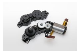
OSD unit for Model A037

The AF drive employs a newly developed OSD (Optimized Silent Drive) to ensure silent operation. Upgraded and optimized for even further reduction in drive noise, this drive allows the lens to be used to your heart's content in all situations where silence is required. With its greatly enhanced quality and speed, the new outstanding AF performance and tracking capabilities mean you never have to worry about missing a shot even when focusing on moving subjects.